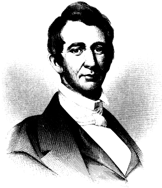
William H. Seward.